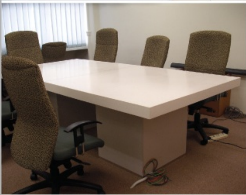
Table Tops / Counter Tops